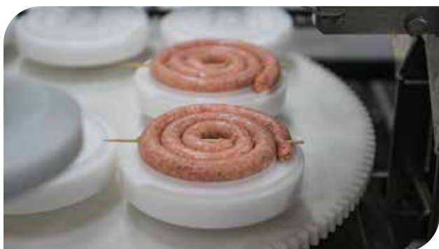
3. Automatic skewering (optional)