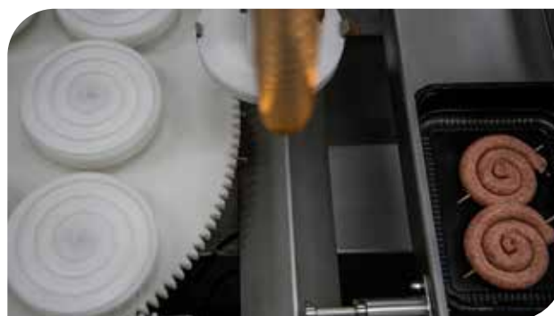
4. Automatic transfer in tray (optional)