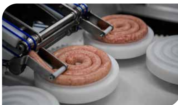
2. Automatic coiling